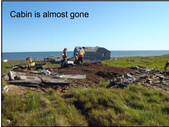
Cabin is almost gone