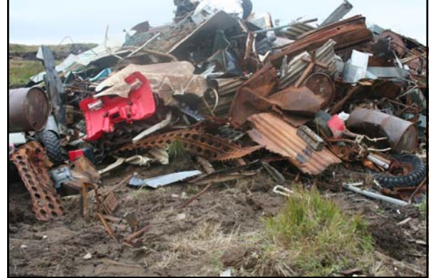
Debris left behind