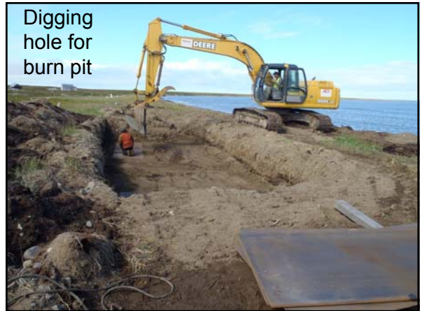
Digging hole for burn pit