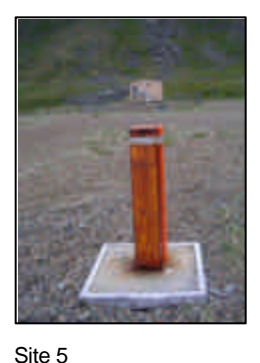
However, the Corps of Engineers will conduct additional investigation of the groundwater quality at Site 5, to demonstrate compliance with ADEC groundwater cleanup criteria in 18 AAC 75.345 Table C. Three additional groundwater monitoring events will be conducted at Site 5 to

There were no significant changes between the Preferred Alternative that was submitted for public comment in the Proposed Plan and the Selected Remedy.